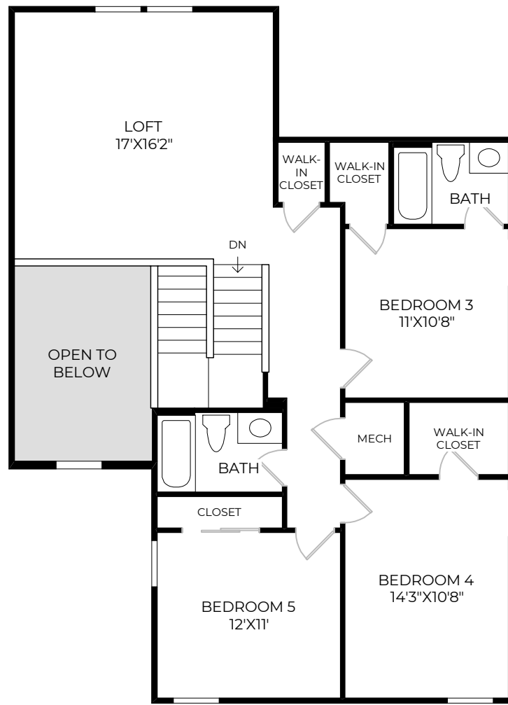
SECOND FLOOR 9' CEILING HEIGHT