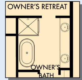
OPTIONAL FREE-STANDING TUB WITH SHOWER AT OWNER'S BATH