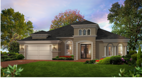
THE MEDITERRANEAN II

Living Area: 2,995 ft 2 Under Roof: 3,994 ft 2